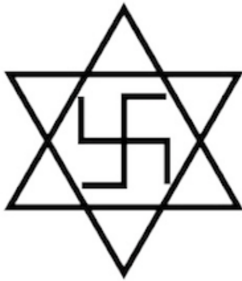
Buddhist from Bardo Thodol Tibetan Book of the Dead