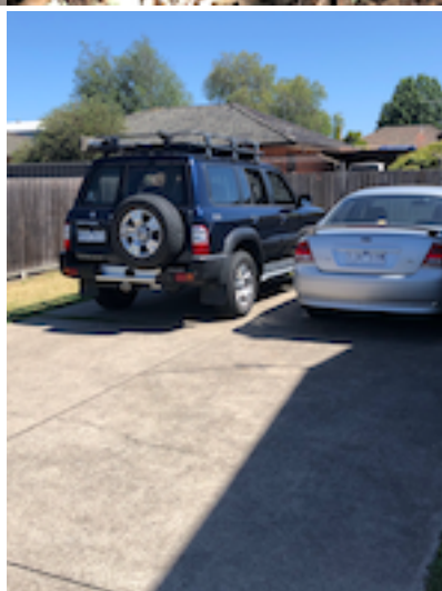
[IMAGES: @1 (LEFT 0934 HOURS) The resident within UNIT #1 and that such PARKING / PRO DOMO dynamic establishing the basis of my claim that this conduct is a deliberate and reckless BREACH OF THE INTERVENTION ORDERS; @2 (1050 HOURS) BOER WAR MEMORIAL;