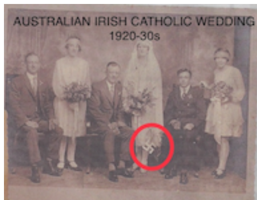
AUSTRALIAN / IRISH CATHOLIC WEDDING 1920-30's WITH SWASTIKA

< http://www.grapple369.com/images/ChristianWeddingsWithSwastikas.jpeg >