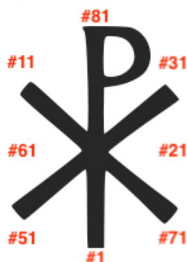
Chi-Rho v's Course of Nature

[JUXTAPOSITION 3x3 ANCHORS TO LUOSHU REFERENCE OBJECT AND HYPOTENUSE TO DOMINION ARRAY]