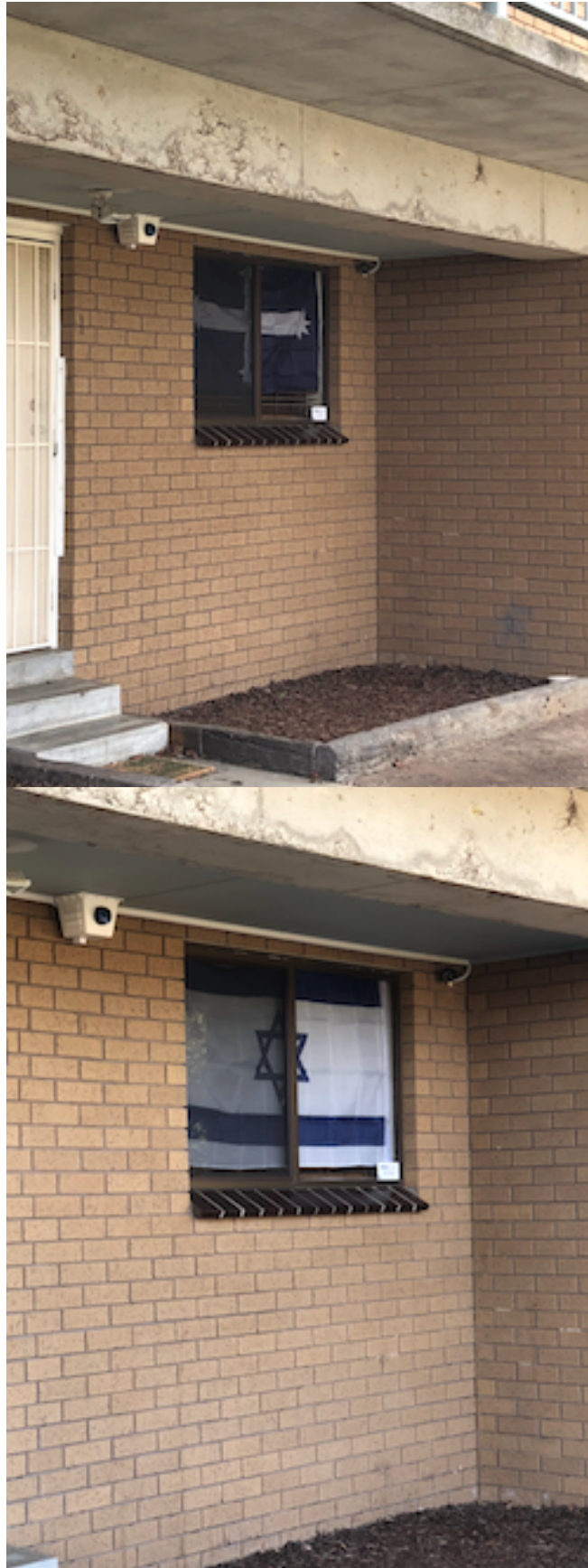
[ IMAGES: PHALLUS ON 7 JUNE 2018; LEST WE FORGET FLAG ON 28 JUNE 2018; EUREKA FLAG ON 10 JULY 2018; ISRAELI FLAG ON 17 JULY